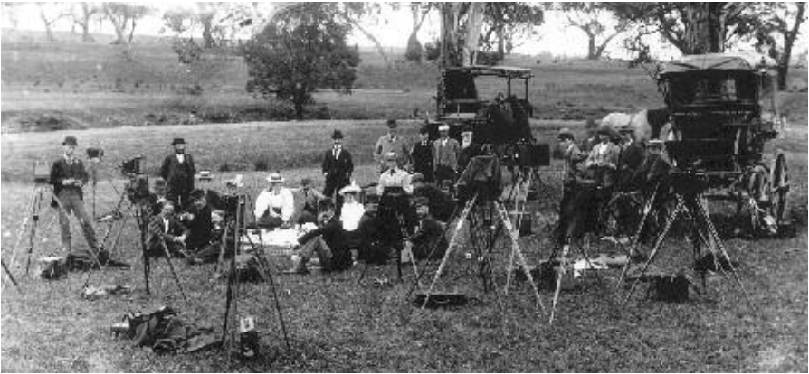
Club and family members on a day trip. Circa 1895. Reproduced from a full plate glass negative.

developing city. There was never a shortage of photographic opportunity with the ever-present activity on the waterfront and the ever-changing nature of the streetscape. Indeed many of the exceptional photographic images of early Geelong held in collections by Historical Societies and private residents are a direct result of the dedicated work of those early members of the Society.