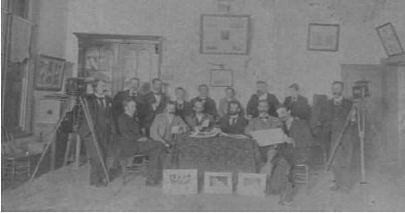
Above is an early flashlight photograph taken of 15 of the Society's members in their clubrooms at the Gordon College on the 29 th April 1898. It depicts a very distinguished group of gentlemen, formally posed and complete with examples of their work and two large format cameras on wooden tripods.