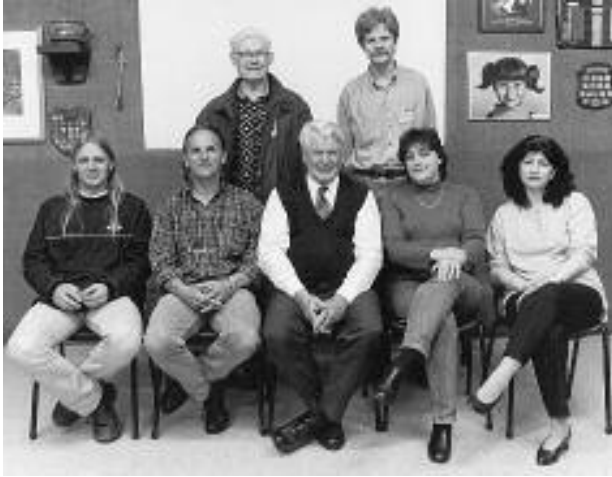
Geelong Camera Club committee 1997-1998