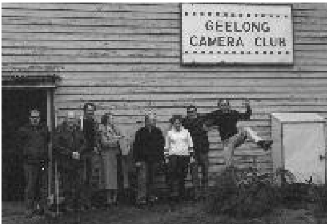
Jubilant members outside the newly acquired clubrooms.

However the move didn't come without much anguish and discussion. The building which the club managed to obtain was unused and almost derelict, with no ceiling or wall lining, one half having a concrete floor whilst the remaining floor was just plain dirt. A great deal of work and finance was required; eight members were needed to act as guarantors for $1600 from the bank to secure the necessary funds. Some members felt that the onus of such a loan was too much for only eight members, so the offer was extended, allowing more members to become guarantors. This resulted in sixteen members acting as guarantors. The bank was amused at the trickle of people who came in to sign the contract. At least they became aware our members cared about the future of their club.