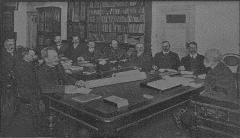
Conference of Victorian Photographic Clubs adopting the Constitution of the Victorian Photographic Affiliation.