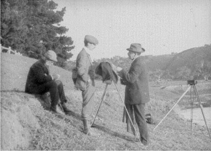
Members on a field trip. Reproduced from a glass slide. Date unknown.