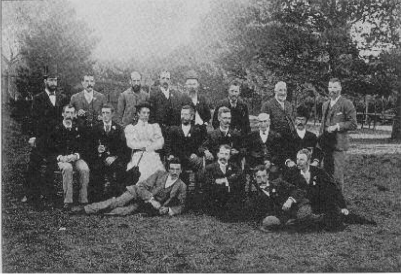
Members of the First Photographic Congress of Australia, Geelong, Easter Week, 1895. Reproduced from a photograph appearing in The Australian Photographic Journal, June 20, 1895.