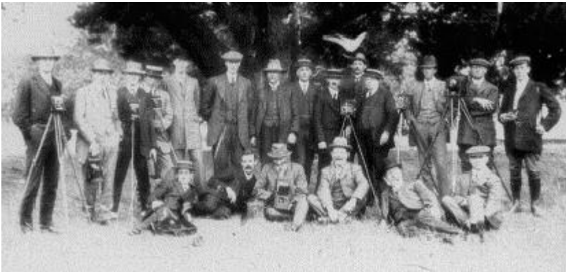
Club members on an outing formally posed with the equipment available at the time. Date of photograph unknown. Reproduced from a glass slide.