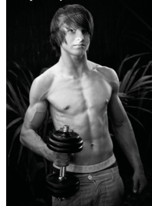
'Pumped' by Neville Ramaker